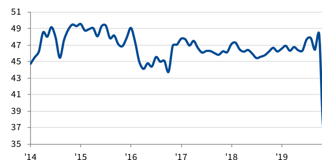
Lebanon PMI sa, >50 = improvement since previous month